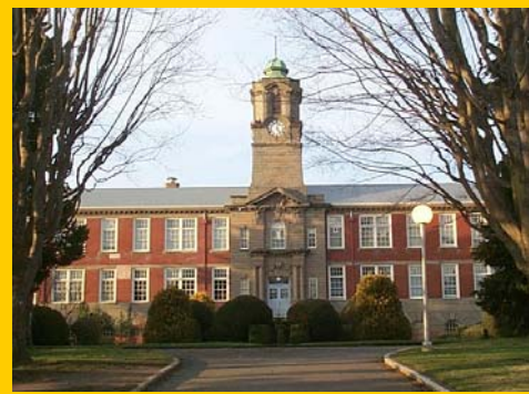
Newly renovated Young Building at Camosun College