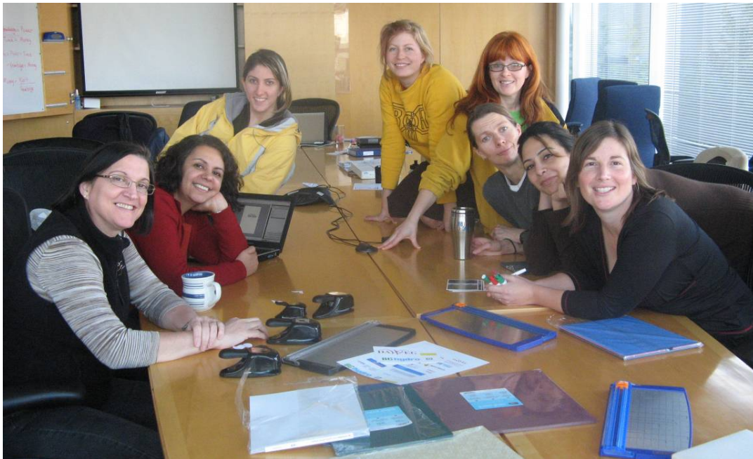
The board directors engaging in a team building exercise by preparing pages for a DAWEG 2007/2008 scrapbook.