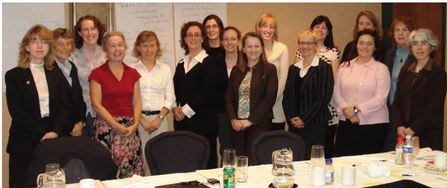
WIEAG Meeting, Toronto, ON October 2007

The next teleconference will likely be sometime in early to mid 2008. Please feel free to contact me at megan.leslie@jacqueswhitford.com if you have any questions about WIEAG.