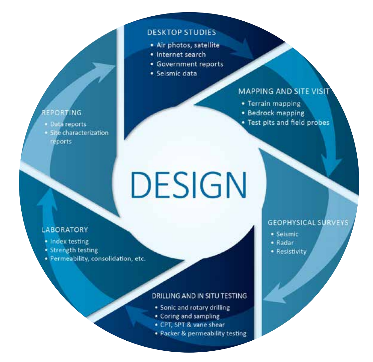
Figure 4-1. Typical Site Characterization Activities to Support Design

Notes: CPT = cone penetration test; SPT = standard penetration test.